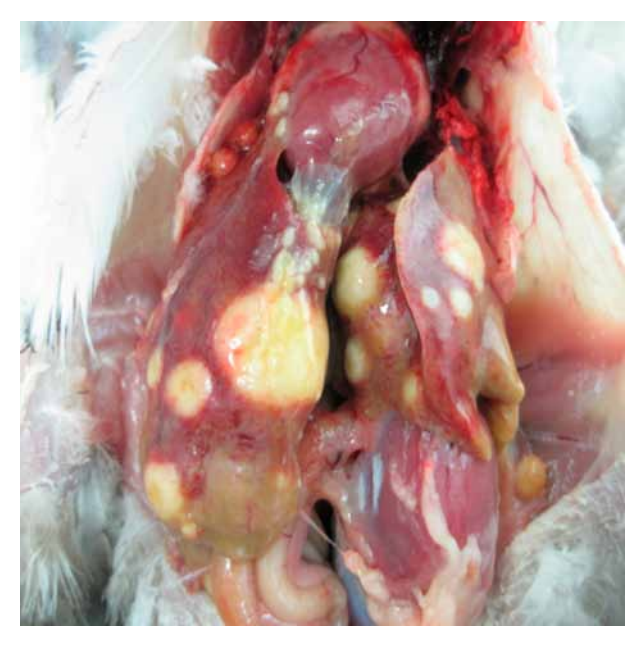
Figure 3: Multifocal granulomatous hepatitis in infect ed pigeons with Mycobacterium avium subsp. avium.

(distilled water).<sup>14,15</sup> PCR products were analyzed on ethidium bromide-stained 2% agarose gels in a submerged electrophoresis system.