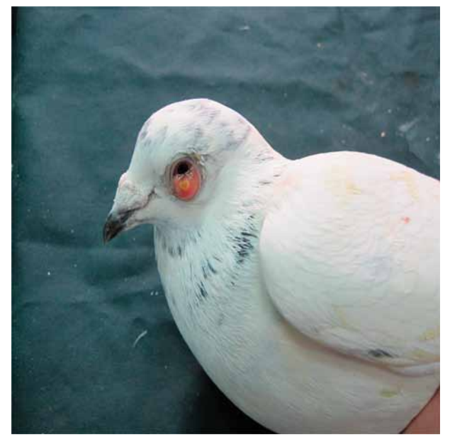
Vol. 11, No. 3, 2013 • Intern J Appl Res Vet Med.