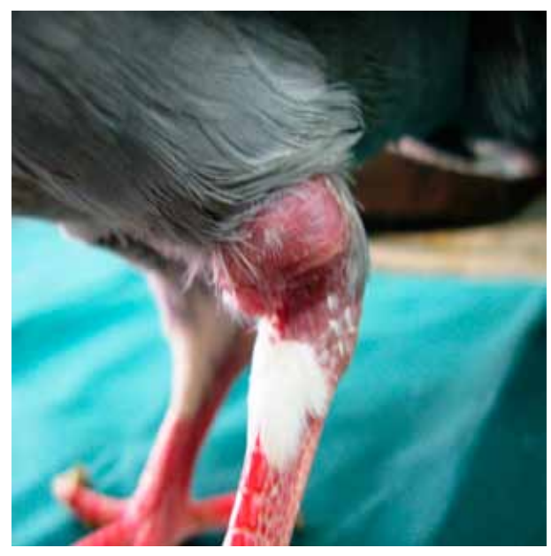
Figure 1 : Soft tissue swelling around the joint, caused by Mycobacterium avium subsp. avium.

cap containers and shipped on dry ice to the tuberculin department of the reference laboratory, the Razi Vaccine and Serum Research Institute, Karaj, Iran for definitive identification.