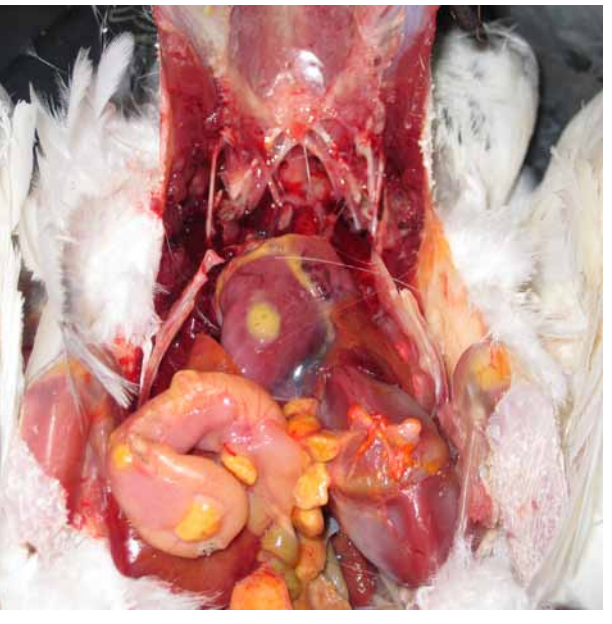
Figure 5: Nodular granulomatous lesions in the intestines of infected pigeons with Mycobacterium avium subsp. avium.

been documented so far in the Iran. In this study clinical signs, necropsy findings, differential susceptibility of male and female pigeon to infection and disease and vertical transmission of MAA in naturally infected lofts of domestic pigeons were described. Isolation via culturing and/or molecular methods remains the most definitive means of diagnosing mycobacterial infection in birds.<sup>16</sup> In present study all of the 52 isolates carried IS901 insertion sequence, a determinant of pathogenicity, and also IS1245 locus. Such isolates belong to serotypes 1, 2 and 3 of Mycobacterium avium are considered as the most pathogenic strains of Mycobacterium avium in birds.<sup>1,17</sup> Beside, morphology of colonies indicated that they belong to the virulent strains.<sup>4</sup> Factors that enhanced the development of disease on the pigeon lofts included stress, due to keeping in a small area, and poor health conditions.<sup>3</sup> The remarkable clinical sign of the disease was swollen joints, which along with other clinical signs or external lesions could help diagnose of the disease though these signs are not pathognomonic.8 Clinical signs, necropsy findings and the isolation of acid